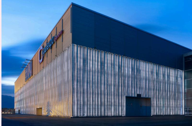
Palexpo Convention Centre