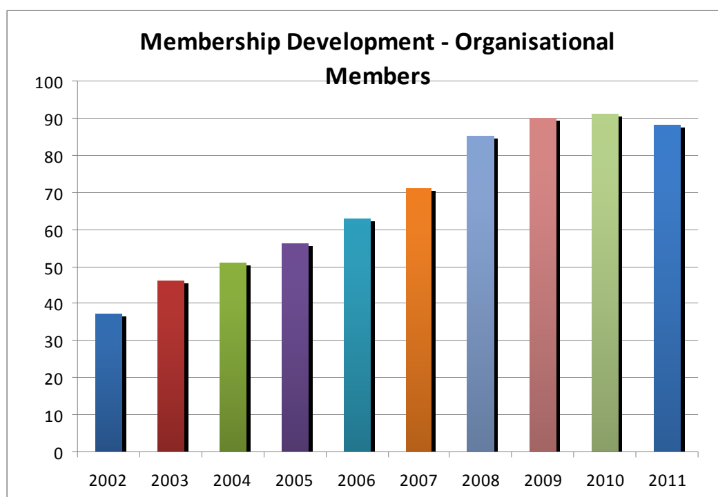
Chart 1: Organisational Members