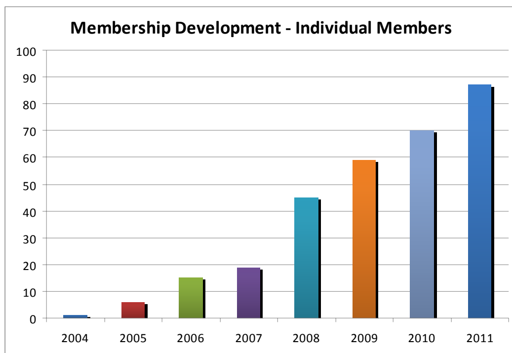
Chart 2: Individual Members