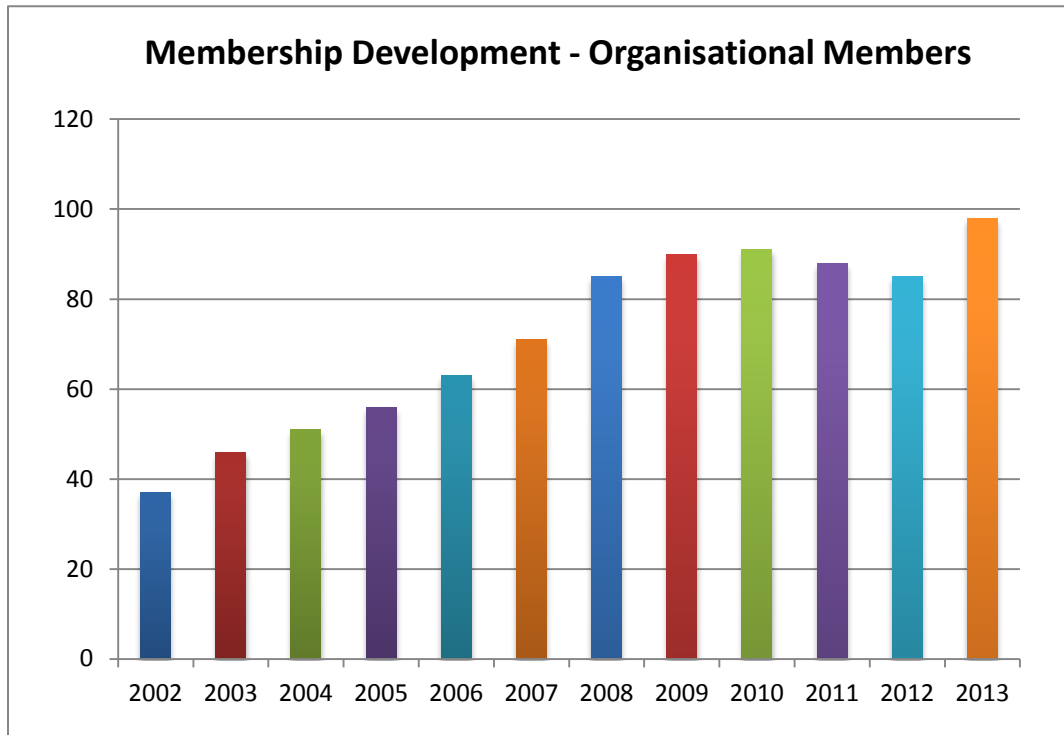
Chart 1: Organisational Members